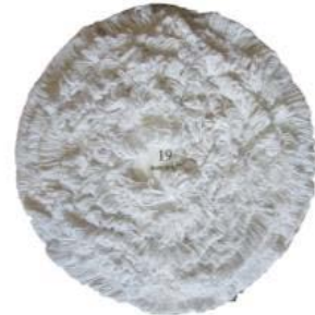
Cotton Wiping Pad

For the first of two steps. Synthetic blend to split/clean the soil, yet not absorb the split material. Has slots to allow brushes from driver to agitate soil.