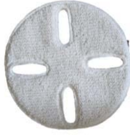
Slotted Cleaning Pad

For maximum low-moisture cleaning results. Provides the perfect amounts of agitation and moisture needed to split stubborn soils, stains and detergent residues.